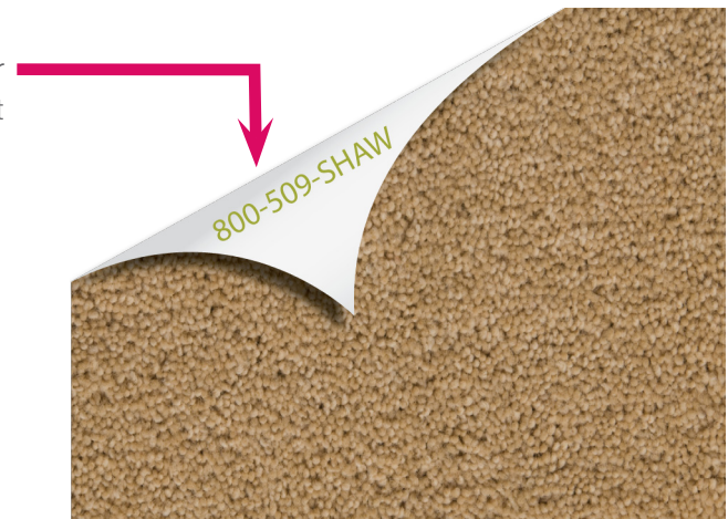
EcoWorx Tile Backing

Include these instructions in the General Contractor scope of work.