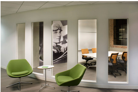
Huntsman Architectural Group