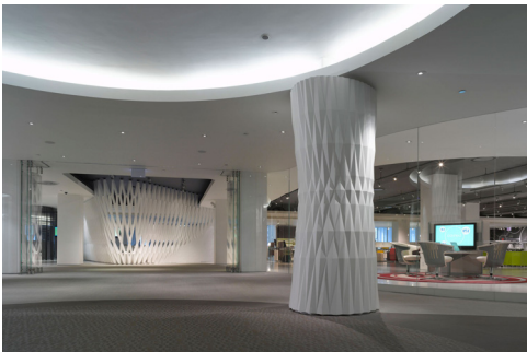
Shimoda Design Group