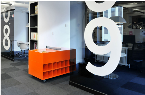
Champaign Raymond Studio